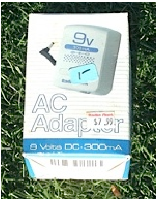
9 V DC Adapter, anonymous donor.