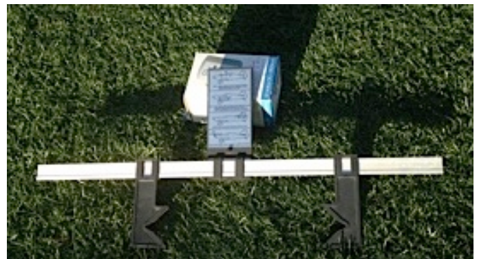
Robart Model Incidence Meter, anonymous donor.