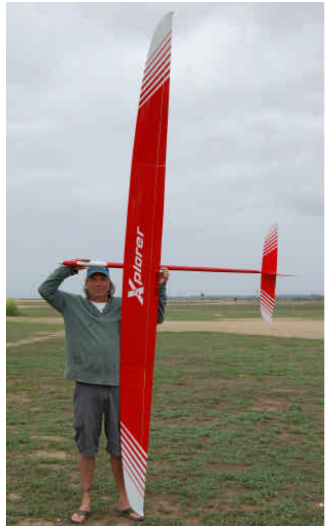
Now that's "Wing Span".