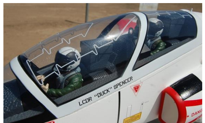
Frank Baker's T-45C Goshawk with flaps, retracts, speed brakes, lights, and tail hook. It has a 90 mm EDF by Free Wing.