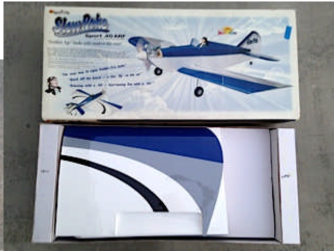
61" Slowpoke kit