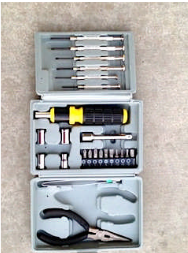
Small tool kit (missing dikes)