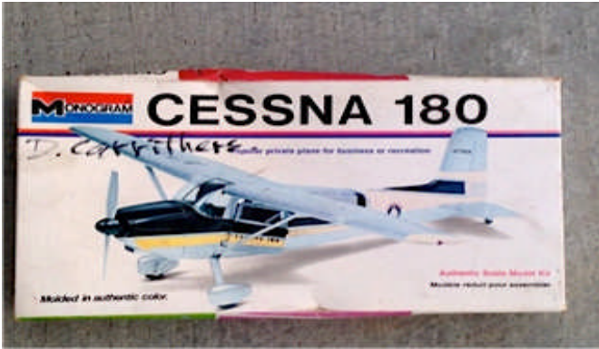
Plastic Cessna 180 kit