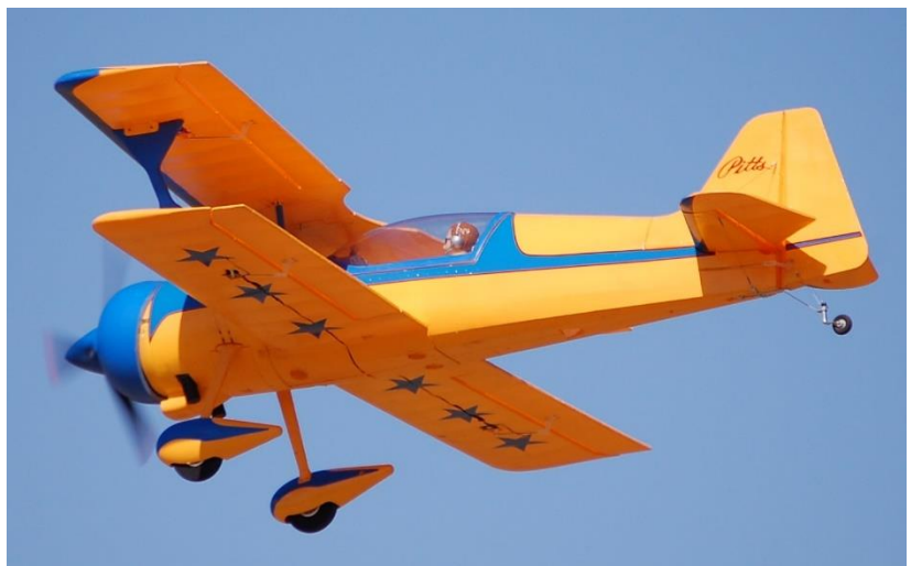
The Pitts S-2 flies as well as it looks.