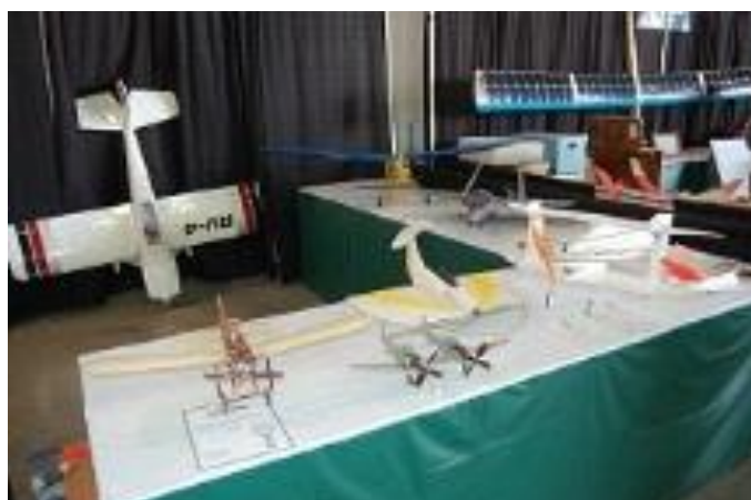
HSS display in the hangar