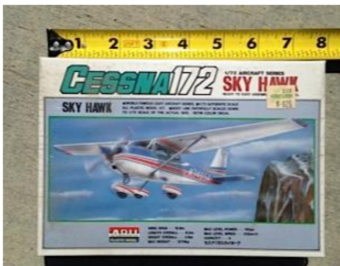
Cessna 172 Plastic model