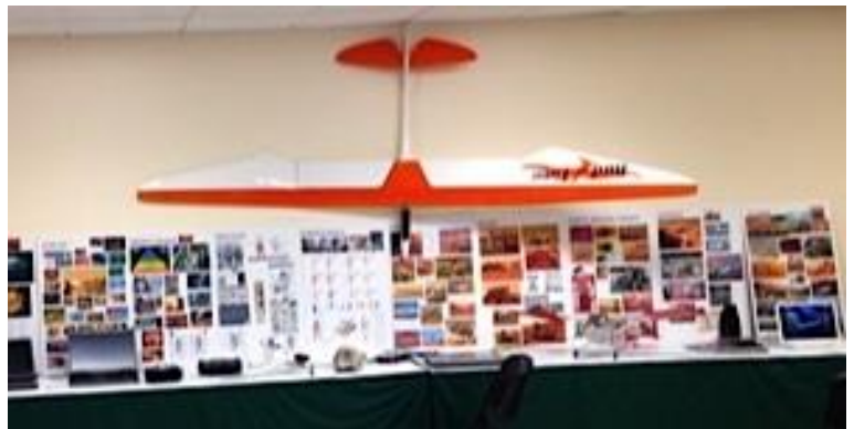
HSS layout in separate room off of main hangar.