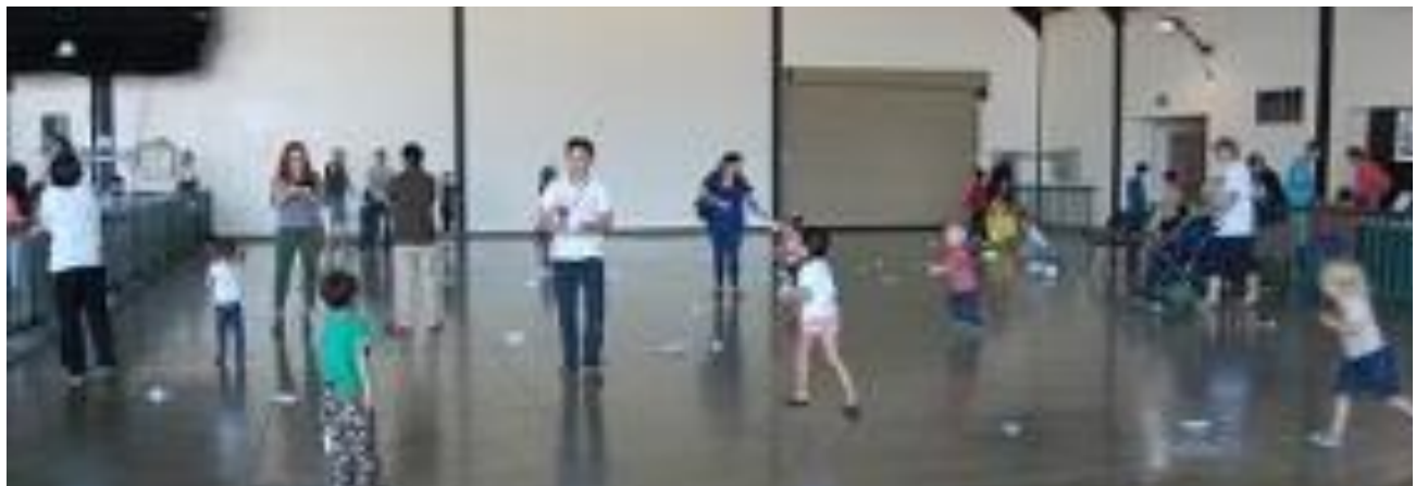
Visitors flying paper gliders inside the hangar.