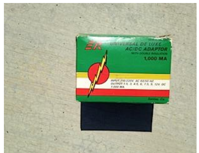
E R 1,000 mA AC/DC adaptor