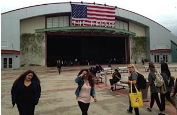
Outside the hangar.