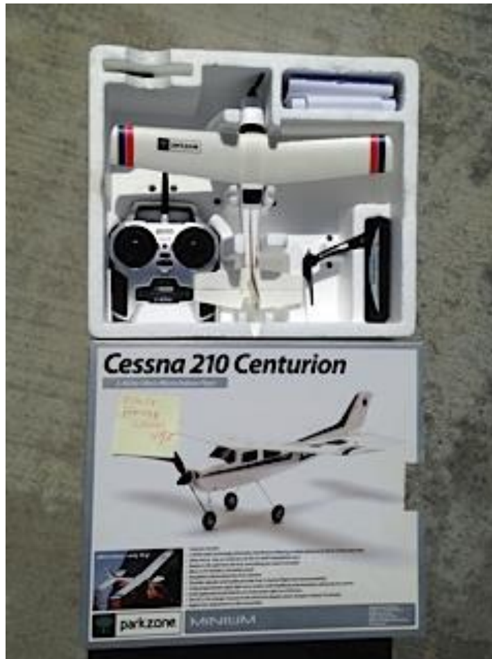
Park Zone Cessna 210 Centurian. Indoor flyer with transmitter.