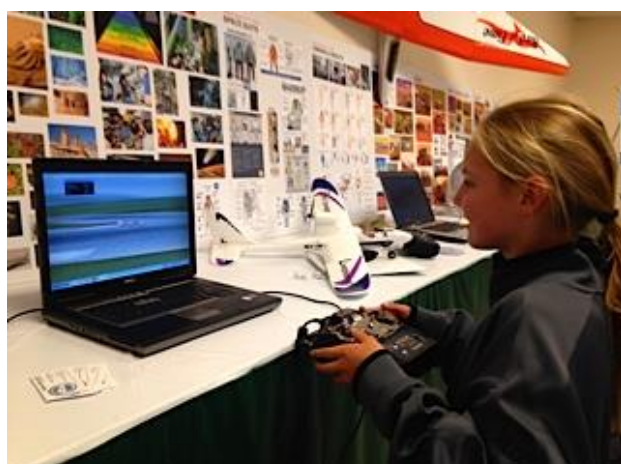
Young girl working the flight simulator. Her grandfather was an astronaut.