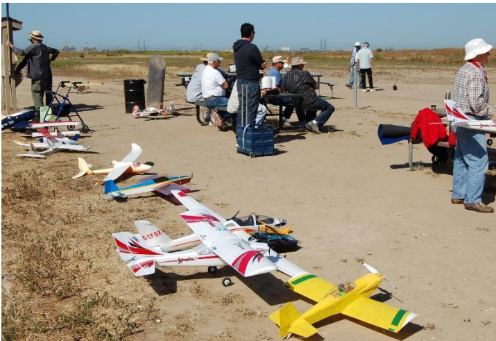
Typically beautiful day for flying.