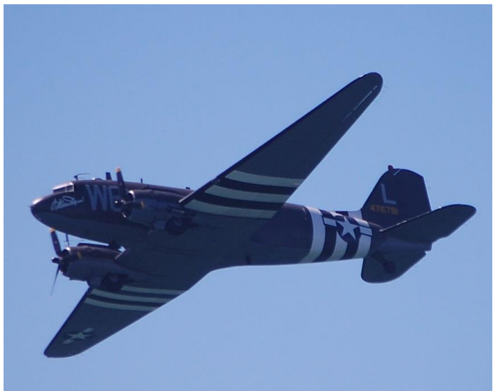
C-47 with invasion stripes.