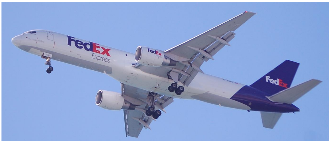
Fedex Boeing 757.