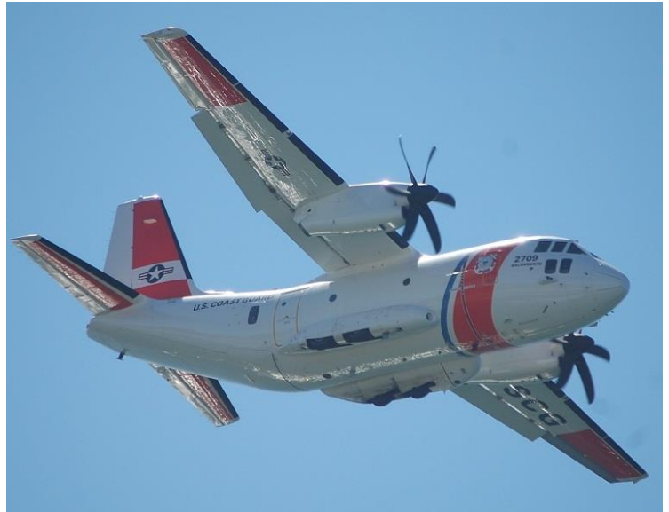
Coast Guard C-23?