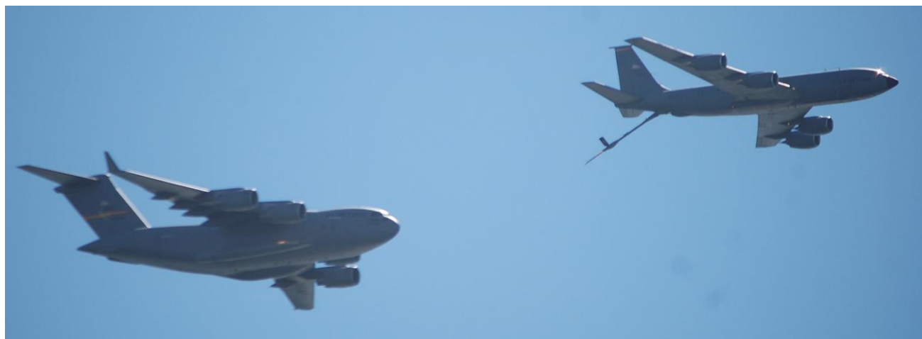
C-17 and KC-135 demonstrating a refueling operation.