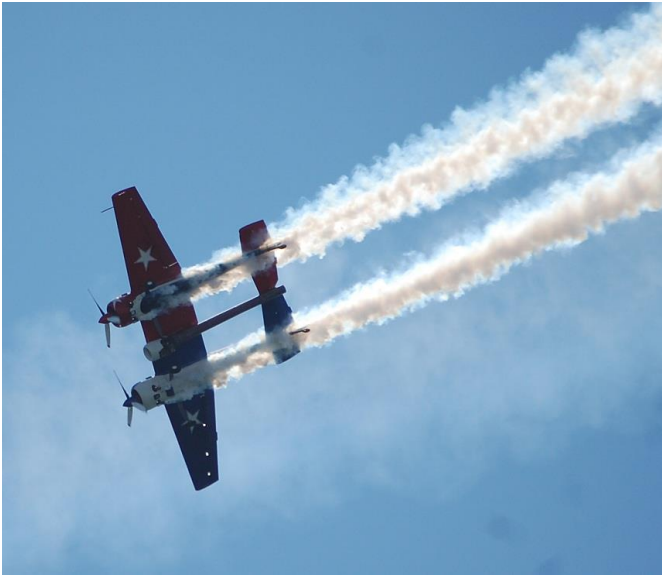
YAK-110. two reciprocating engines, one jet.