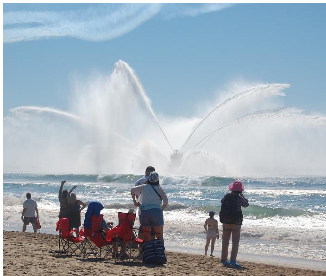
Fireboat almost obliterated in its own display.