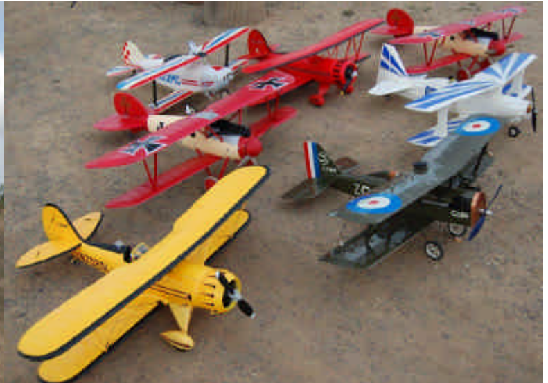
A bunch of biplane's.