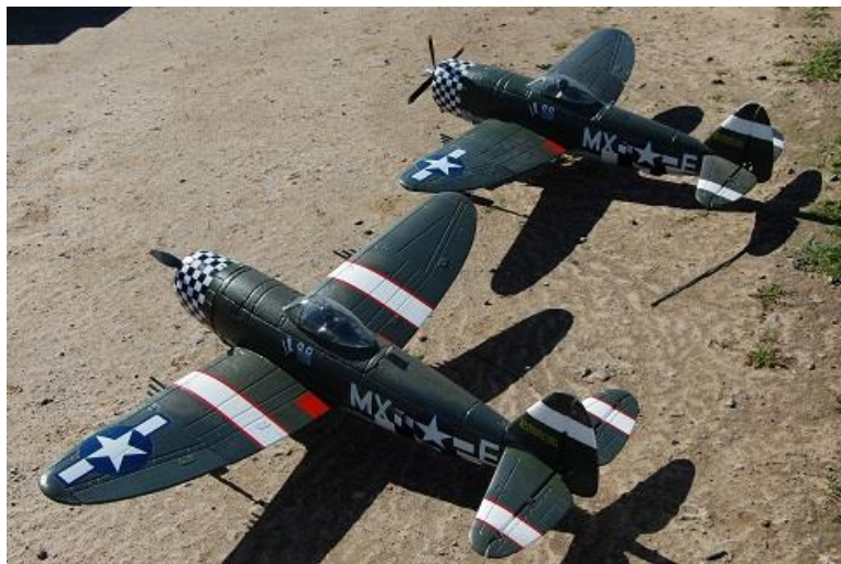
Two P-47s. One belongs to Arman