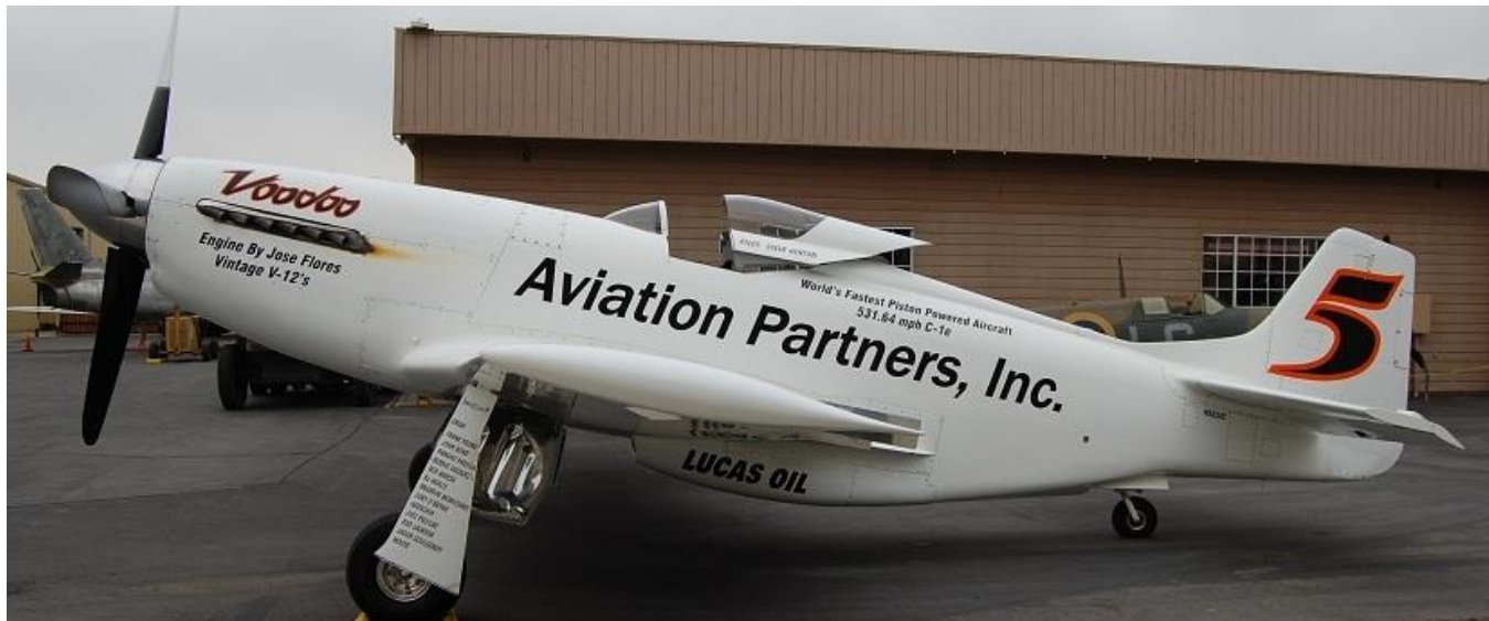
Note the laminar airfoil at the wing tip.

These are all shots of the "Voodoo" P-51. The world's fastest piston powered airplane which set a new record of 531.64 mph.. Pictures were taken at the Planes of Fame air museum at Chino; on Jan 5, 2019. The plane was on display and was flown for the people attending the monthly seminar. The pilot, Steve Hinton, was the main speaker and flew the plane for all to admire. After he landed he parked the plane in front of everyone and ran the engine up to a high rpm - talk about loud!!! What a beautiful, clean plane. Steve explained the modifications to clean up the plane and give it a big increase of power. I believe the power achieved is 3400 hp, up from the most common Rolls Royce Merlin power of about 1695 hp.