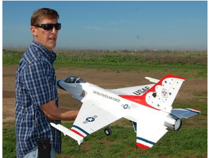
Sorry, no name but neat plane.- Ed.