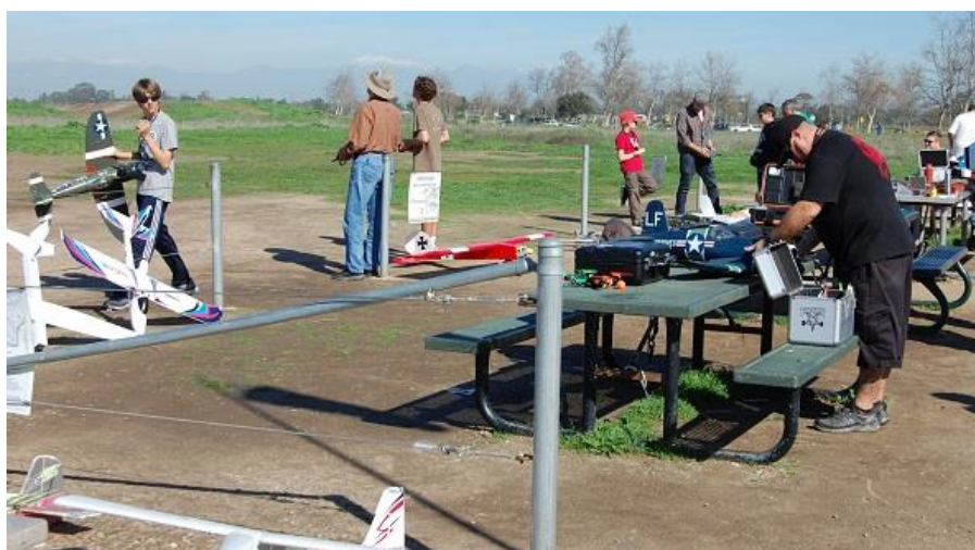
Busy day at the old flying field