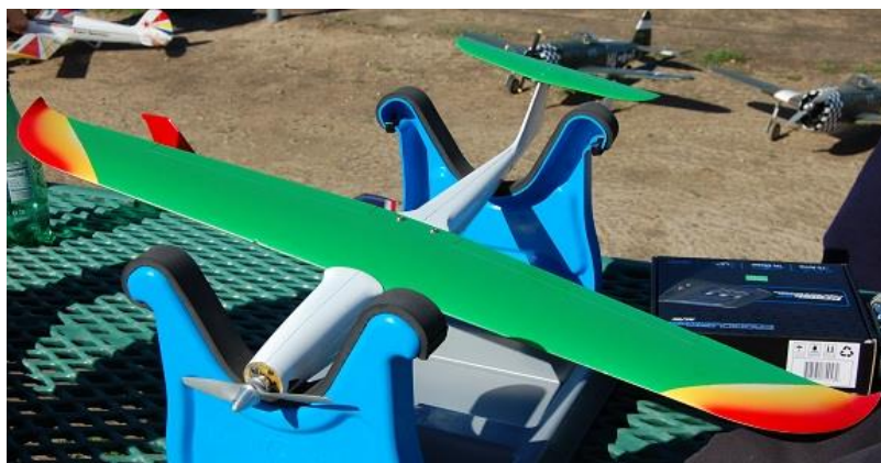
A nice racer. Sorry, no name. - Ed.