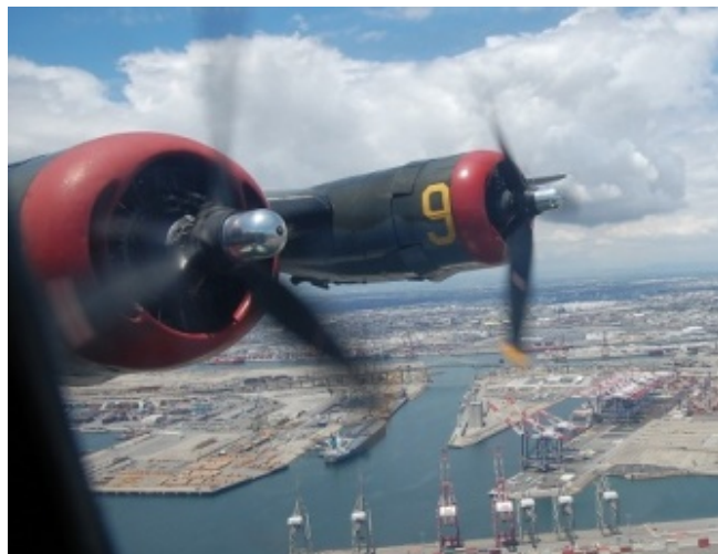
Winging out over Long Beach.