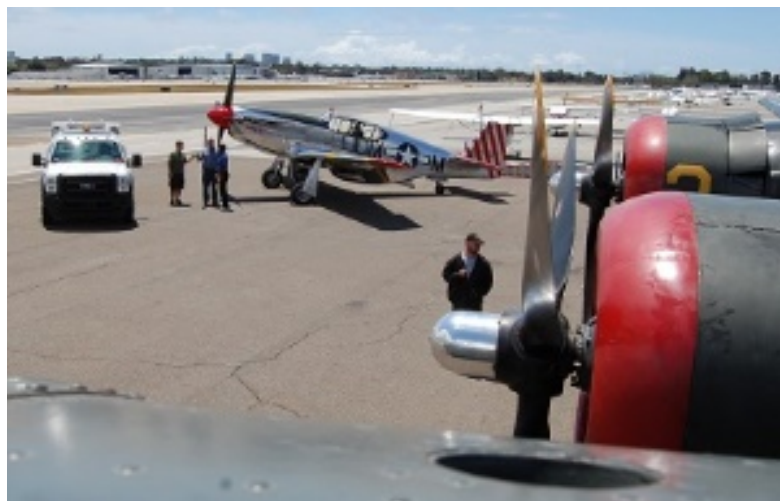
Looking out from the top observers hatch.