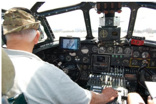
Hero pilot before takeoff.