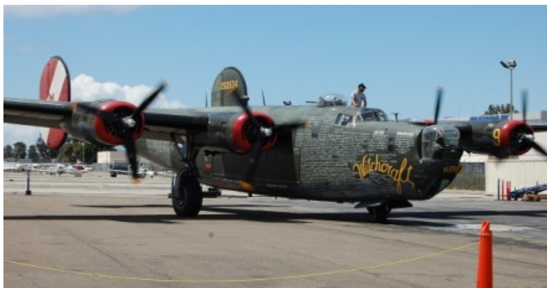
The B-24 coming to take Rob for a flight.