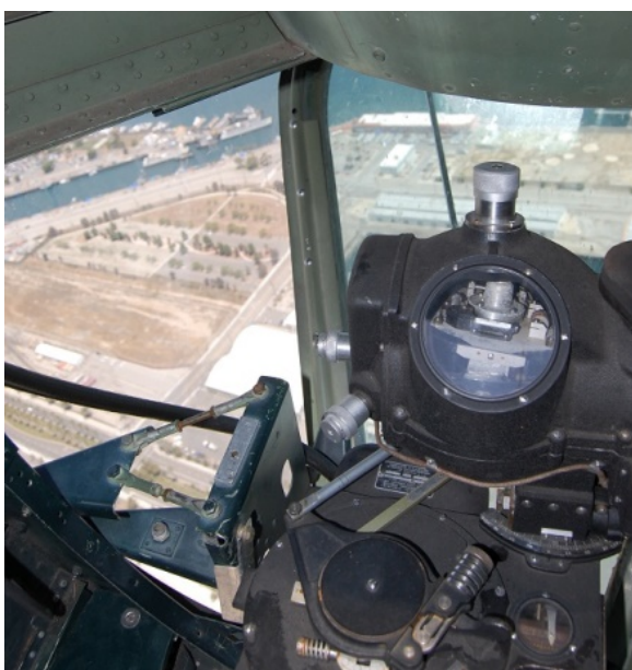
The Norden bombsight from the bombardier's station.