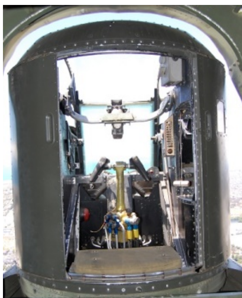
The tail gunner's turret.