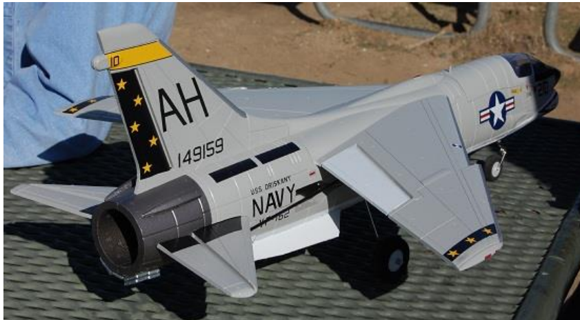
Another view of Jerry's F8U.