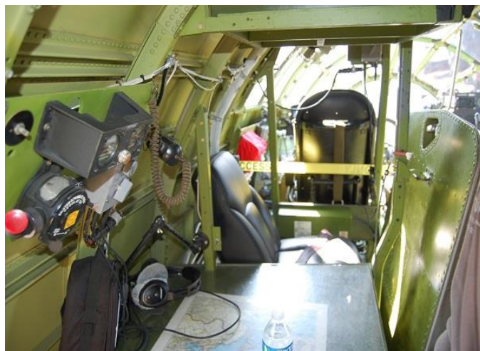
The navigator's station behind the pilot.