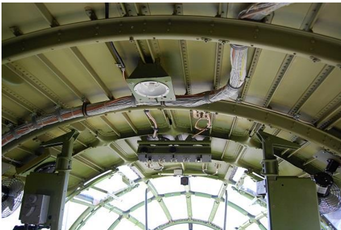
Switches and levers above the pilot and copilot.