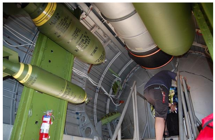
Boarding ladder leading to the flight deck from the bomb bay.