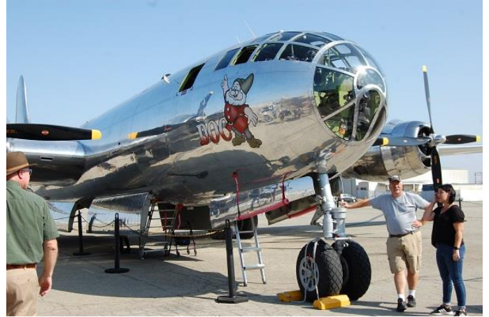
Doc's nose art. Note the superb polish. Lots of "Never Dull".