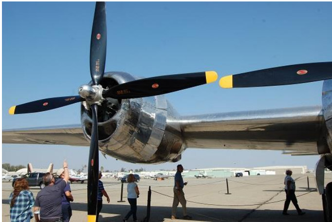
One of the four R-3350 Wright Cyclone engines.