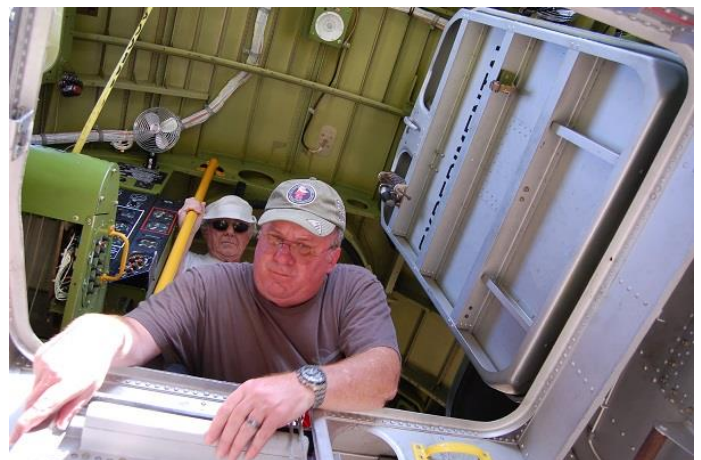
A crew member checking the exit ladder.