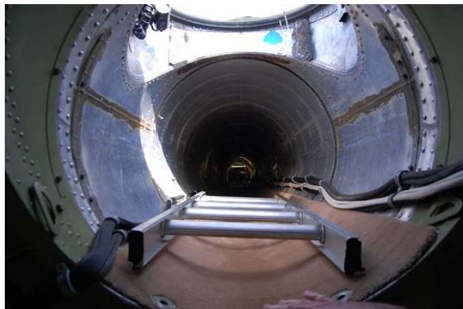
The tunnel that allows access and pressurization between the front and back half of the aircraft.