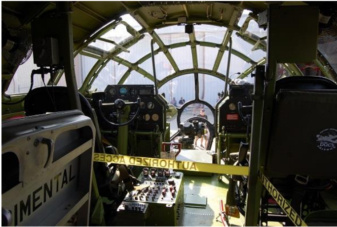
Looking in on the pilot's and copilot's seats.