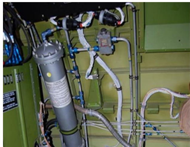
Wires and plumbing.