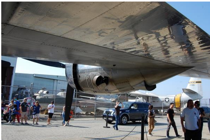
Engine nacelle and flaps.