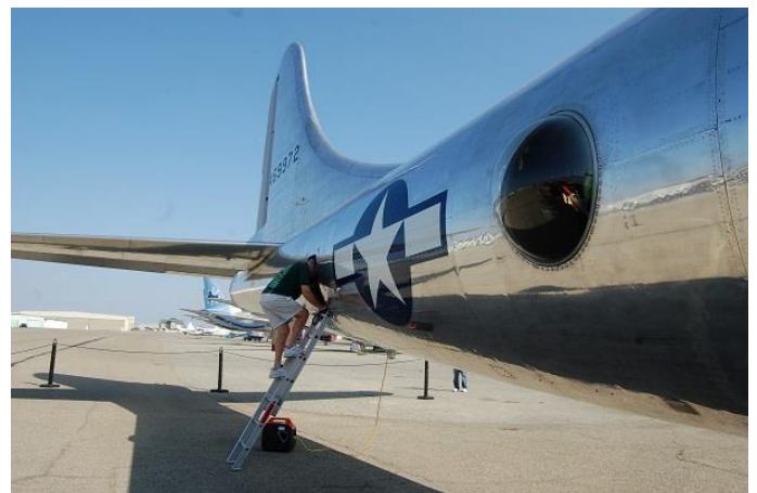
Aft boarding ladder. Gunner's viewing port.