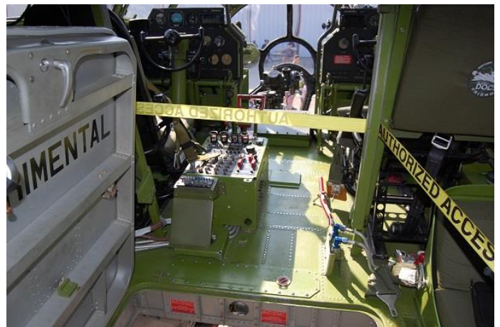
The engineer's control panel not visible on the right.