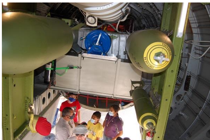
View of the bomb bay from the flight deck