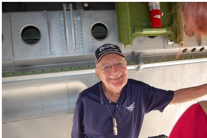
Welcoming crew at the bomb bay entrance to the ladder leading to the flight deck