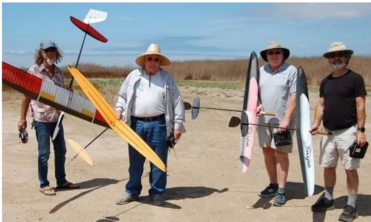
Above left are the glider guys.