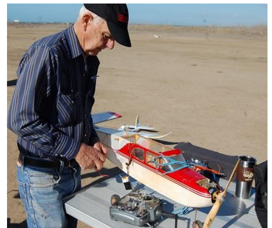
Also, working on his Senorita.