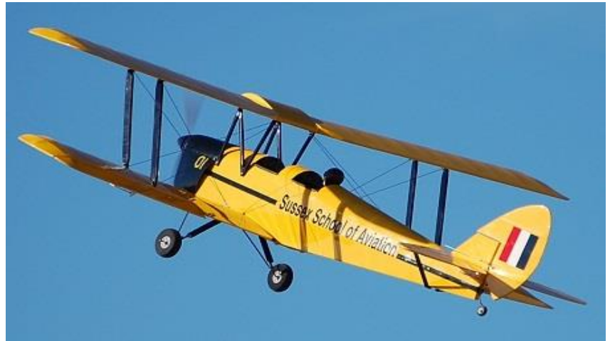
And off it goes.