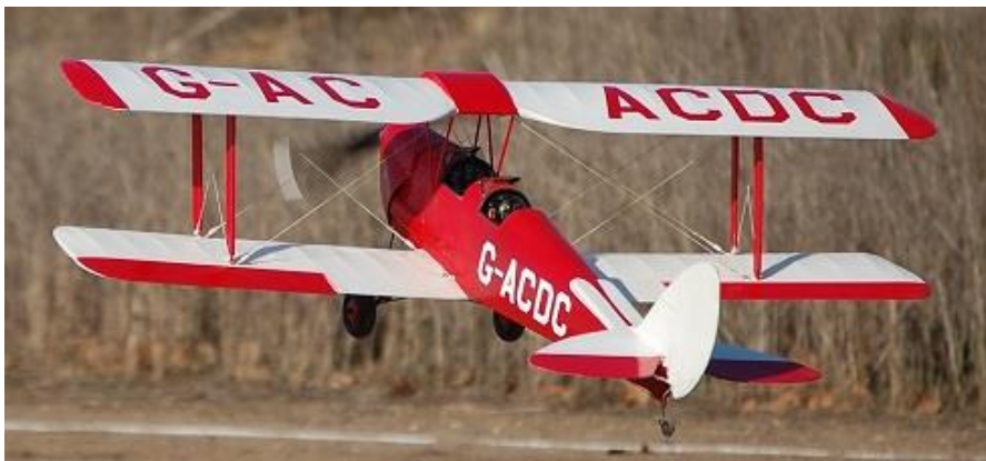
A shot of Walt's other Tiger Moth.