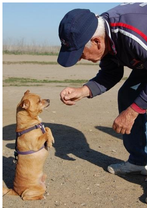
"Freeway" doing tricks.