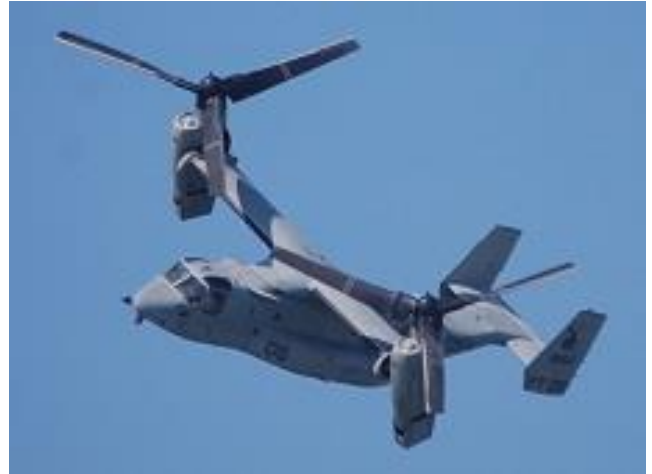
MV-22 Osprey doing a mode change.