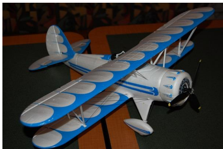
A nice close-up of the WACO.

Rob Askegaard won a desk model of the Airbus 330.