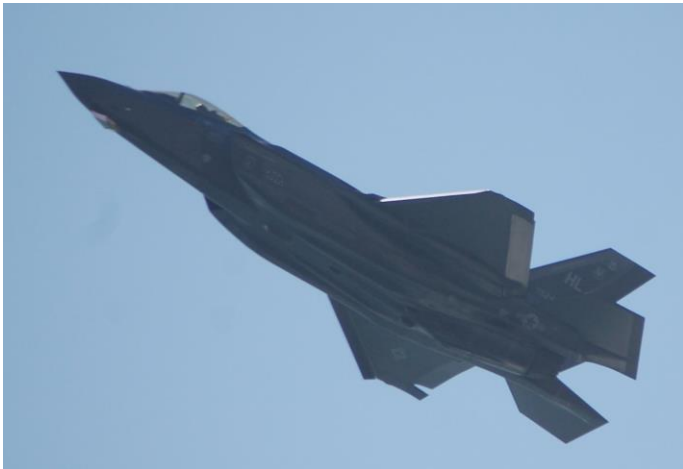
One of the ear splitting F-35's.