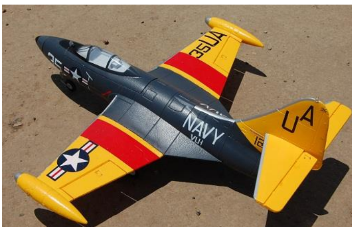
Chris's Panther looking sparkling new.