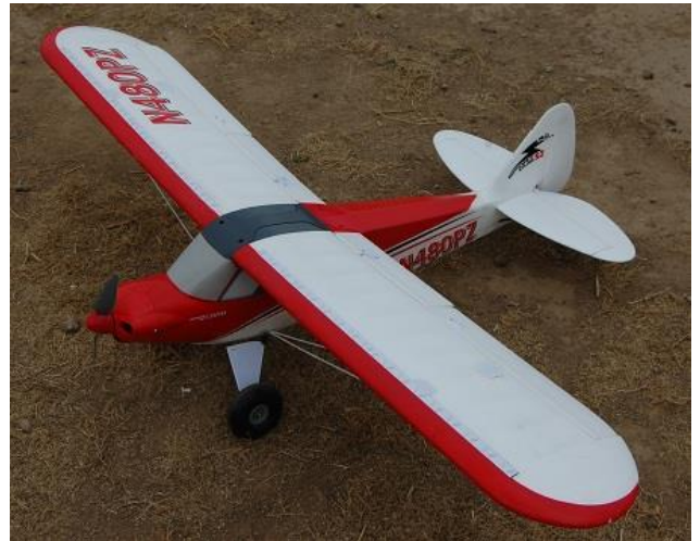
Tom's Sport Cub 52 by Horizon.