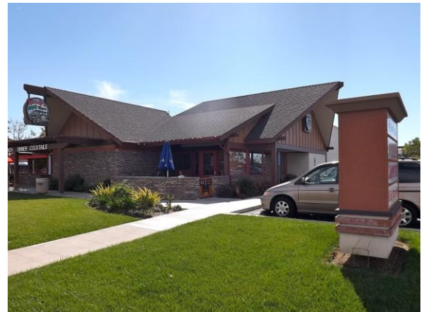
Woody's Diner, 10136 Adams Avenue, HB.

Come join us to celebrate Christmas, enjoy the camaraderie of club members, and install our HSS officers for 2020. We will have a spectacular raffle of neat planes and stuff.