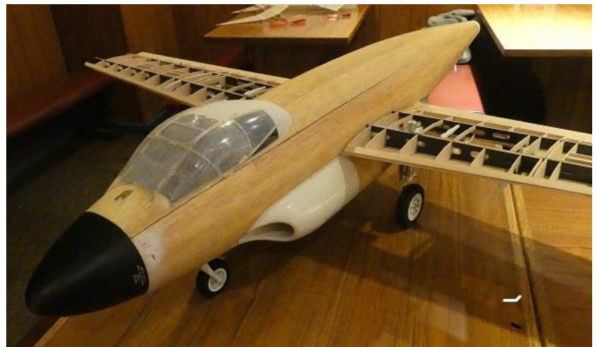
The F3-D Skyknight without its tail structure.