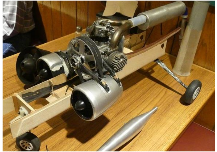
Two cylinder engine showing ducted fan drive.