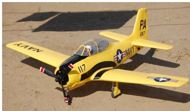
Nice T-28 with great scale looking prop.