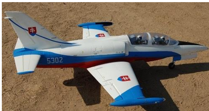
Above is an L-39 by Freewing.