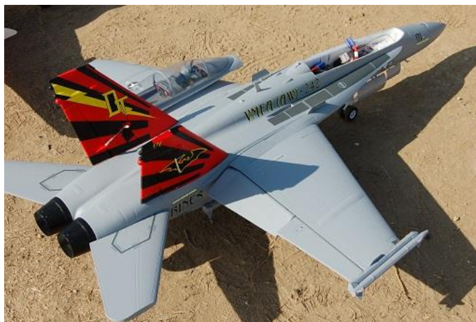
F/A – 18 E-Flite ducted fan.