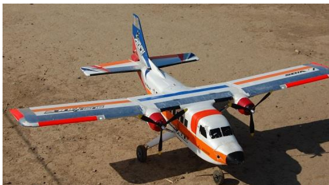
De Havilland Twin Otter.