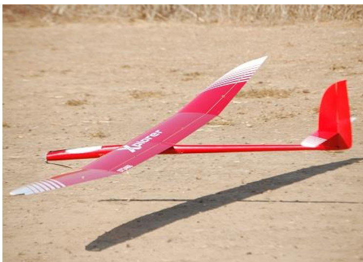
Explorer motor-glider coming in for a landing.