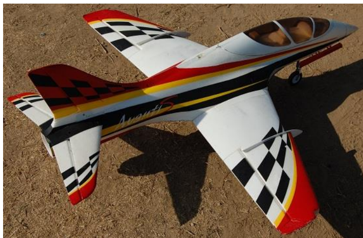
Avanti "S" by Freewing.