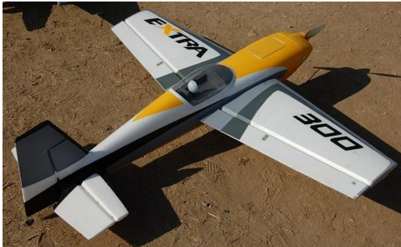
Nice electric Extra 300 available from E-Flite.