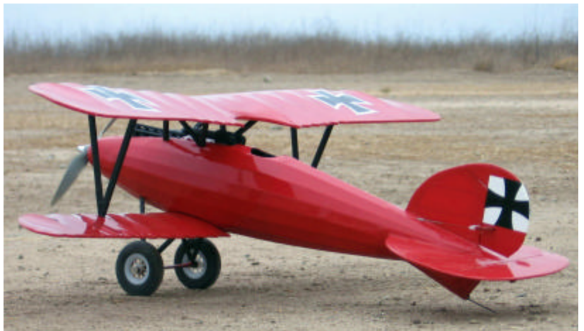
Great view of Kenny's finished Albatross