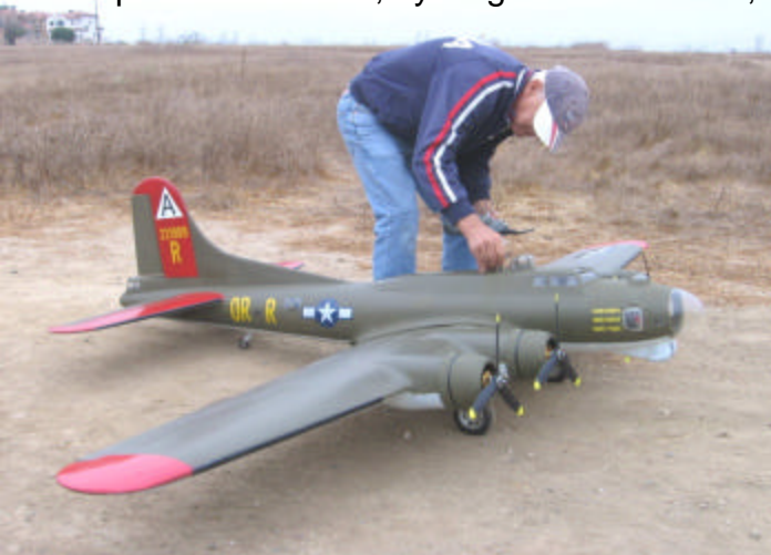
Walt Cloer and his big beautiful B-17. Yeah, we have featured it before, but it is too neat not to show again.