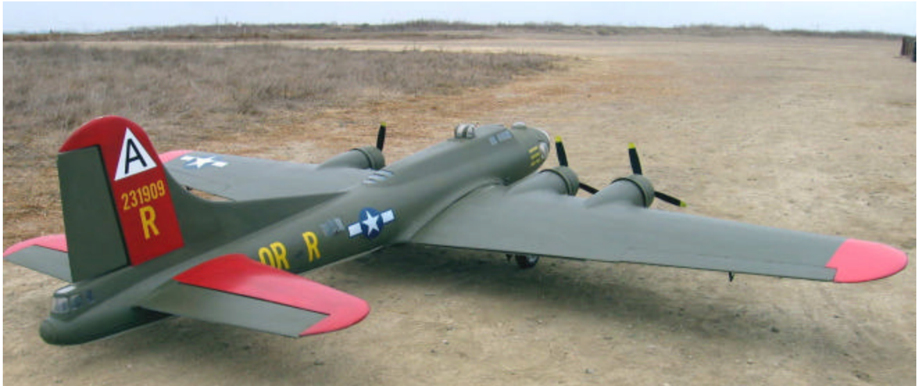
Walt's 108" wing span B17 waiting at a World War II British airfield.