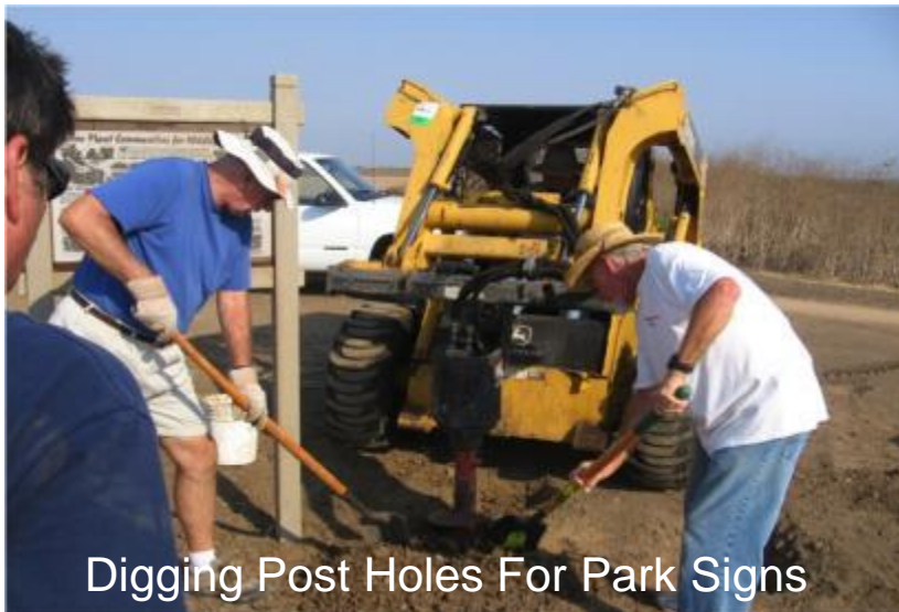
Digging Post Holes For Park Signs