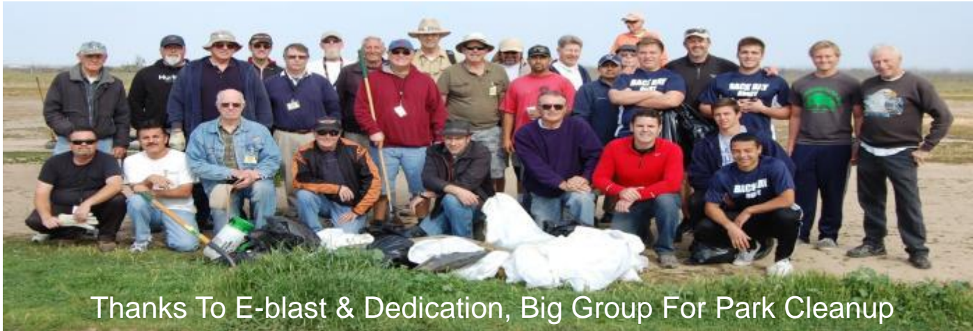
Thanks To E-blast & Dedication, Big Group For Park Cleanup

HSS ACTIVITIES: And We Actually Do Real Work, No Cost To City