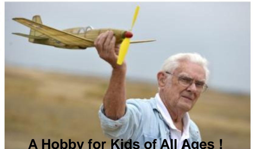
A Hobby for Kids of All Ages !