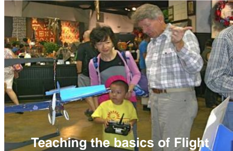
Teaching the basics of Flight