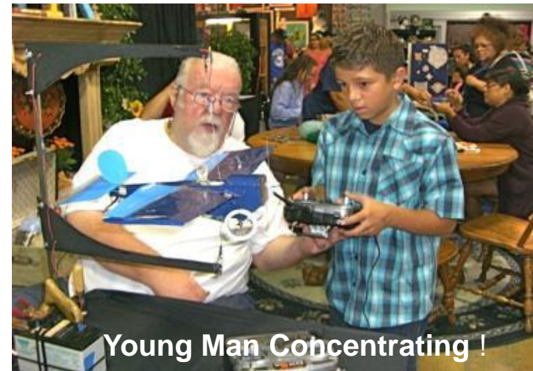
Young Man Concentrating !