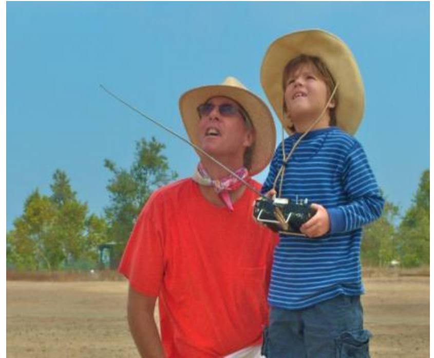
Future pilot looking skyward, success !