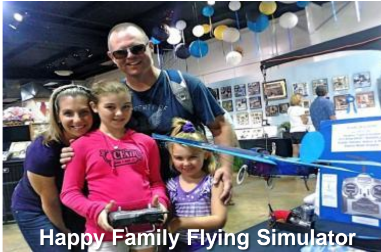
Happy Family Flying Simulator