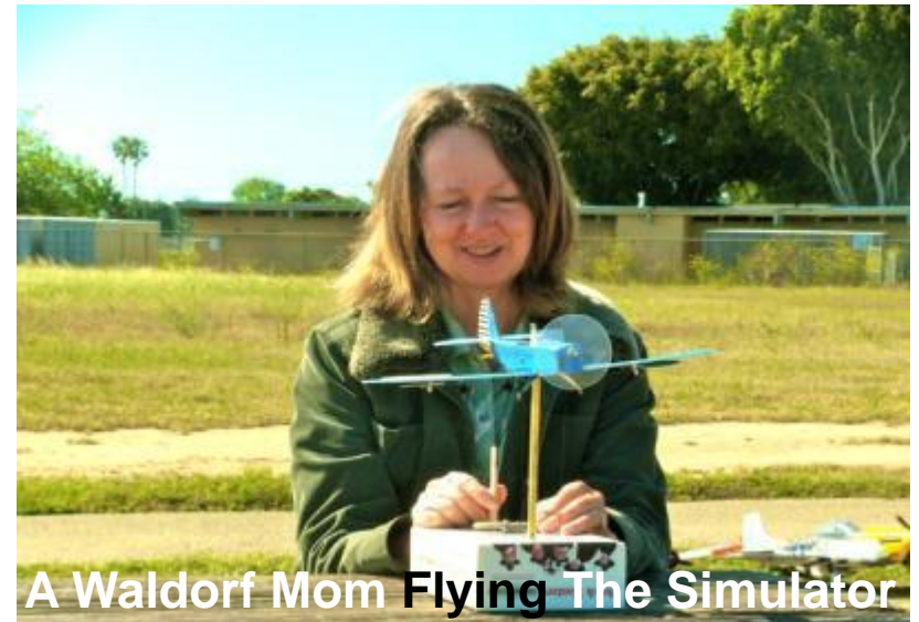
A Waldorf Mom Flying The Simulator