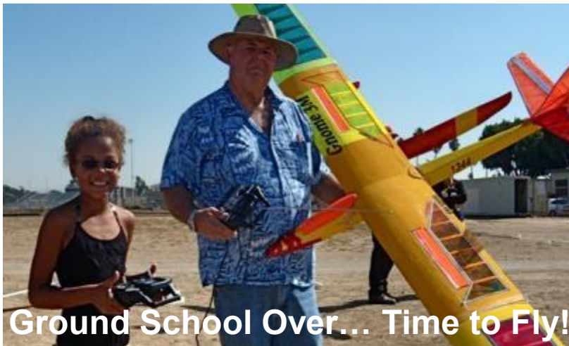
Ground School Over... Time to Fly!