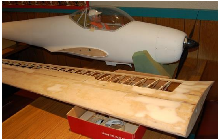
His 5.5 meter ASK-14 motor glider.