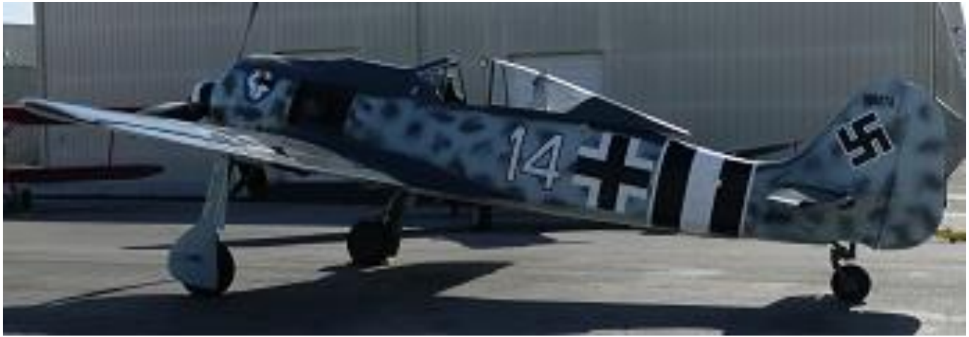
FW-190 rebuilt from actual parts and also new parts made from drawings. Powered with an American Pratt and Whitney engine.