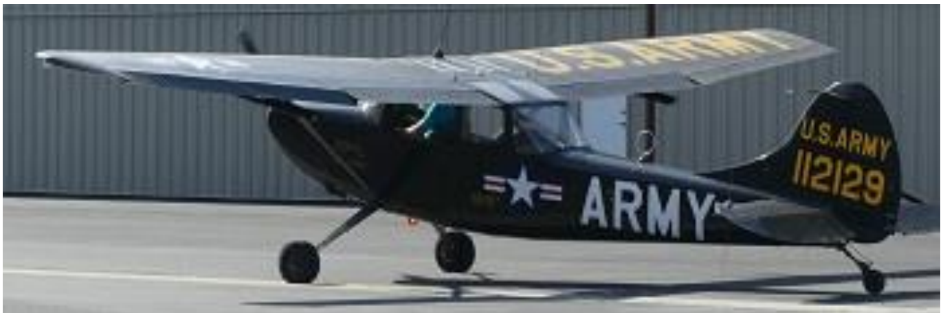
the winner of a raffle got a ride in this Cessna (L-19) O-1 Bird Dog.